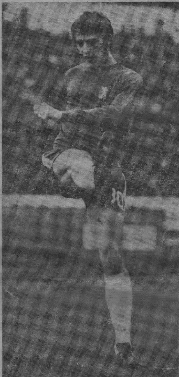
Hutchinson — the "no-hoper" made good.