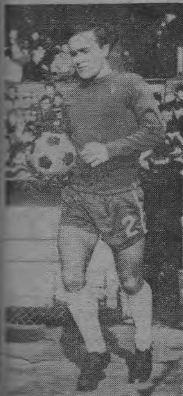
Harris . . . iron man in defence.