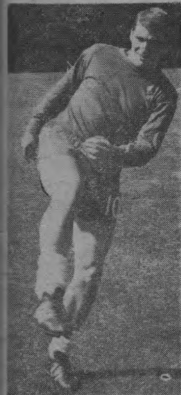
Cooke . . . conjures victory out of nothing.