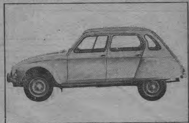
Citroen Dyane £598 ex. works, Inc. p.t.

Joined Chelsea 15 months ago from Fulham, A Londoner, he has 10 international caps for Republic of Ireland through his parents' birth qualifications.