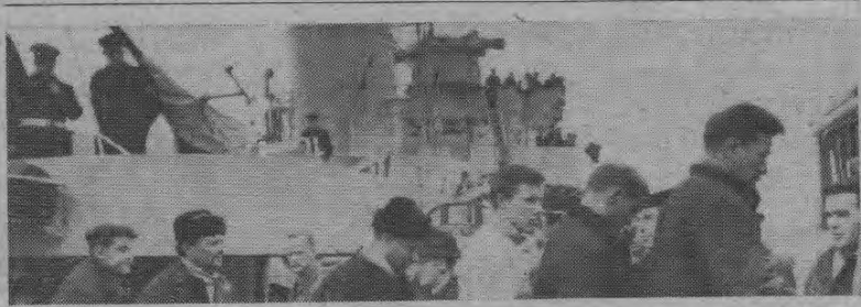
Members of the crew of a Soviet trawler which sank today after a collision with a Danish frigate, disembarking from the frigate on its return to Copenhagen. All 23 crewmen were rescued.